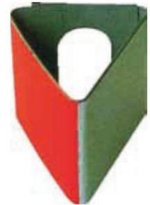
Type V reflector